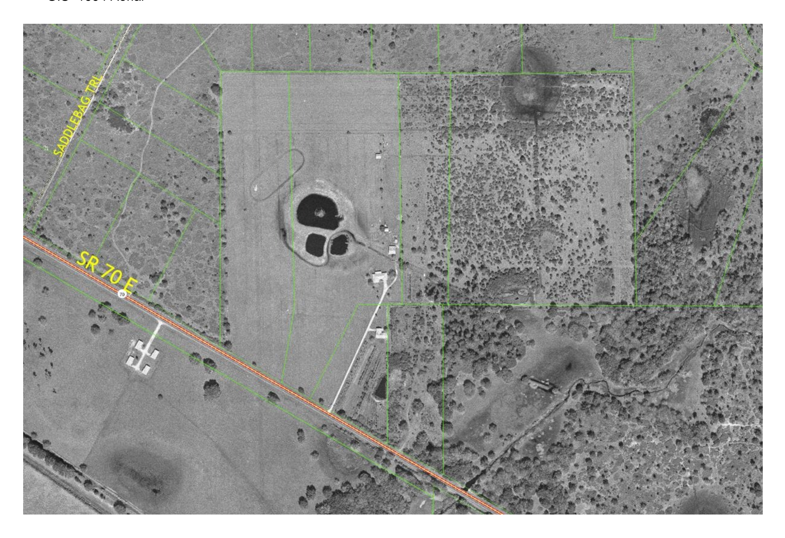
GIS -1994 Aerial